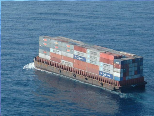
Container on Barge