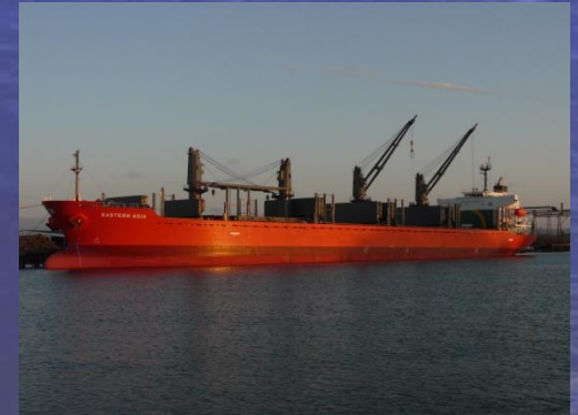
Local Bulk/Project Cargo